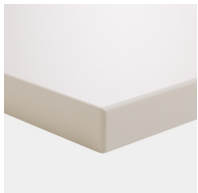
Board material melamine coated with robust plastic edge