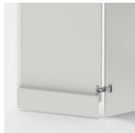
With drag base on the door