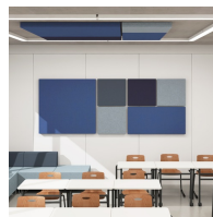
Unterschiedliche Größen und Stofffarben