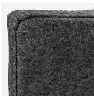
Saubere Befestigung mit stabiler Montageplatte, geschraubt