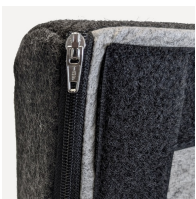
Abnehmbarer und waschbarer Bezugsstoff