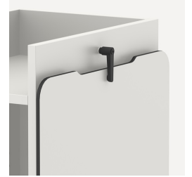
Verriegelung für Aufsatzplatte