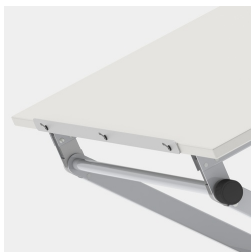
Optionally with book stop bar