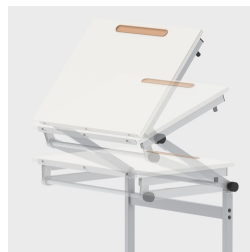
Sturdy, stable and infinitely adjustable frame made of metal