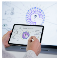
Simple screen transmission from all end devices