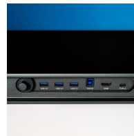
Connections integrated directly in the housing