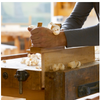
Solid beech wood from sustainable forestry with water-based varnish