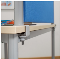
Mounting by means of Allen screw on the table top