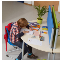
Ideal as a view and sound insulation