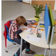
Ideal as a view and sound insulation