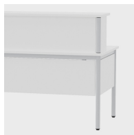
Elegant look: continuous table leg