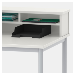
Storage compartment creates order and preserves overview