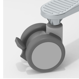
Including 5 robust double swivel casters with total locking device