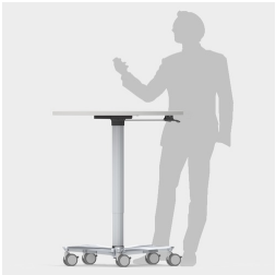
Can also be used as a mobile lectern