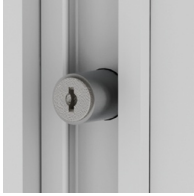
Roller sliding doors lockable