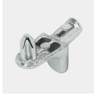
Pull-out proof shelf supports