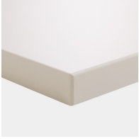
Board material melamine coated with robust plastic edge