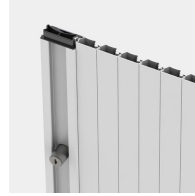
Stable guide rails