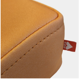
High quality crosscut seam