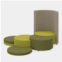
Wide range of possible combinations of COCOON and JOYN series