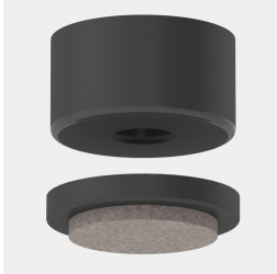
Optional felt floor protector with interchangeable insert