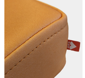
High quality crosscut seam