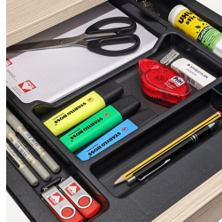
utensil drawer for office supplies