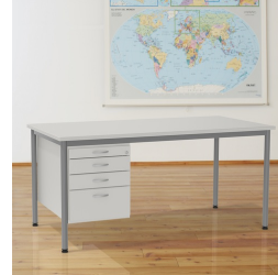
Suitable for our 1000 and 2000 table series