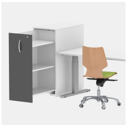
Provides more privacy at work