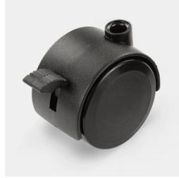
Mobile on 4 lockable double castors