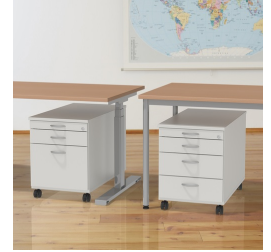
Suitable for our OFFICE tables and 1000, 2000 table series