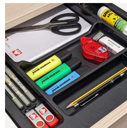
utensil drawer for office supplies