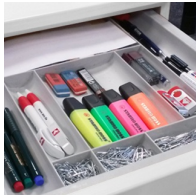
utensil drawer for office supplies