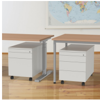
Suitable for our OFFICE desks and 1000 and 2000 desk series