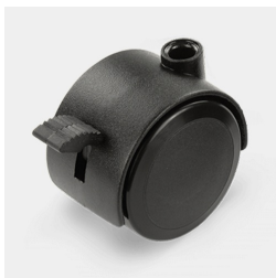
Mobile on 4 lockable double castors