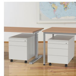
Suitable for our OFFICE desks and 1000 and 2000 desk series