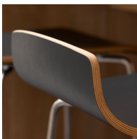
Robust beech multiplex shell with scratch-resistant CPL coating