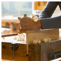
Solid beech wood from sustainable forestry with water-based varnish