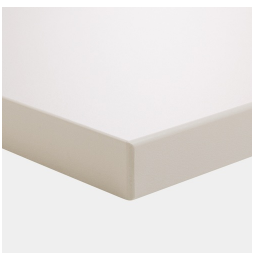
Melamine coated table top with robust plastic edge