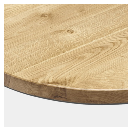
Optionally with solid oak table top