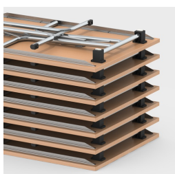
Stackable up to 16 tables