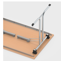
Easy folding of the table legs