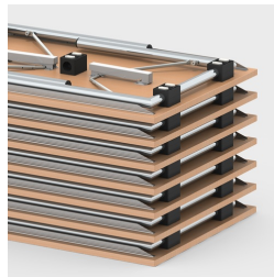
Stackable up to 16 tables