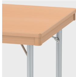
Optionally with recessed solid wood frame