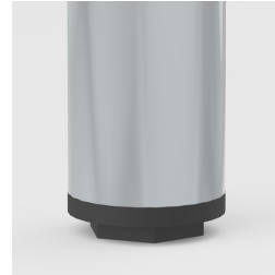
Floor protector with level compensation: compensates for uneven floors