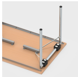
Easy folding of the table legs