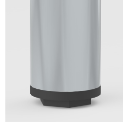
Floor protector with level compensation: compensates for uneven floors