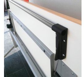
Triggering of the folding function by means of 2-hand safety operation