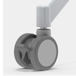
Including 4 robust double swivel casters with total locking device