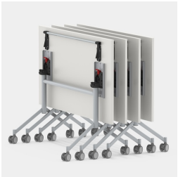
Space saving nestable