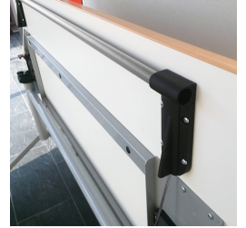
Triggering of the folding function by means of 2-hand safety operation