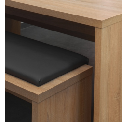
Optionally with comfortable bench support