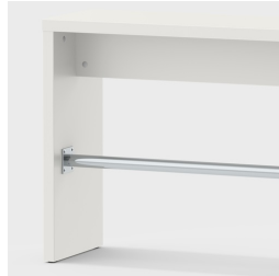
Footrest included for comfortable resting of the feet