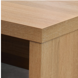
Surface melamine coated with robust plastic edge