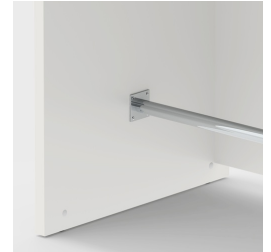
Footrest included for comfortable resting of the feet