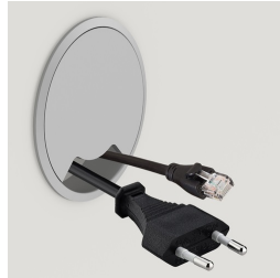
Optionally with side cable aperture