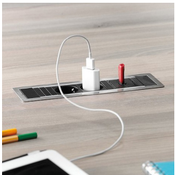
Optionally two floor sockets each with USB port or network connection: left and right