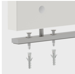
Optionally with floor mounting