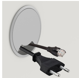
Optionally with side cable aperture