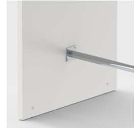
Footrest included for comfortable resting of the feet