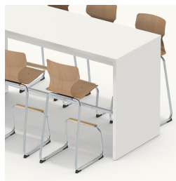
Seating on both sides