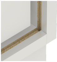
Resistance to warping due to 8 mm thick back wall