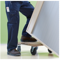
Carcass firmly doweled and glued ex works