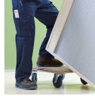
Carcass firmly doweled and glued ex works