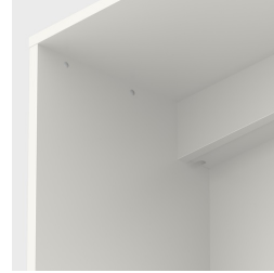
With integrated cable duct, rear