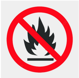
Support panel material flame-retardant according to DIN 4102 B1