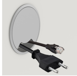
Optionally with side cable aperture