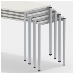
Stackable up to 4 tables due to special frame design