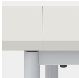
Table tops can be placed together without joints