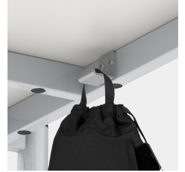
Optionally with one folder hook per seat