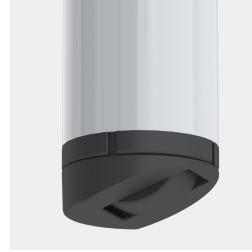
Optional frame mobile by means of 2 rollers