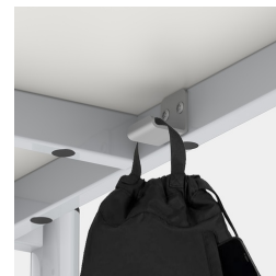
Optionally with one folder hook per seat