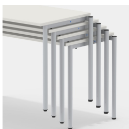
Stackable up to 4 tables due to special frame design