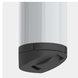
Optional frame mobile by means of 2 rollers