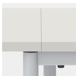
Table tops can be placed together without joints