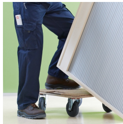
Carcass firmly doweled and glued ex works