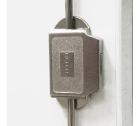
High quality locking bar