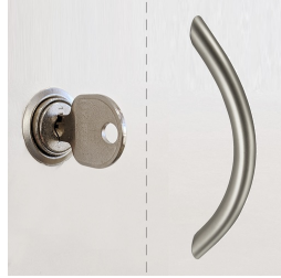
1 OH cabinet with handle or lock