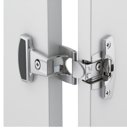
Metal cup hinges with 240° opening angle