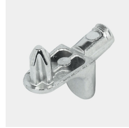
Pull-out proof shelf supports