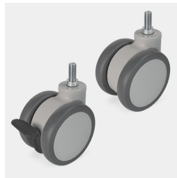
Mobile on 4 castors, 2 of which are lockable