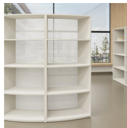
Back wall made of translucent plexiglass