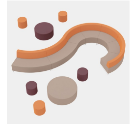
Can be combined with CYLINDA, BLOC and COMBI series