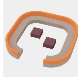
Can be individually extended with MAZE and straight DOMINO seating elements