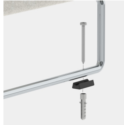
Optional mit geschraubter oder geklebter Bodenbefestigung