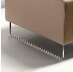
Stable sled frame optionally chrome-plated