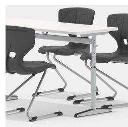
Seating on both sides due to central column frame