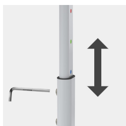
Height adjustable by means of locking device