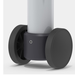
Optional frame mobile by means of 2 fixed castors