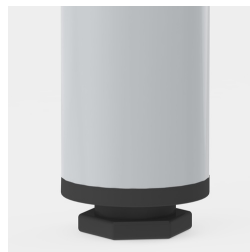
Floor saver with level compensation compensates for uneven floors