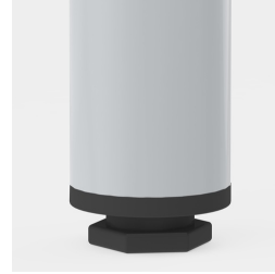
Floor saver with level compensation compensates for uneven floors