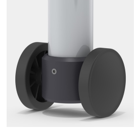
Optional frame mobile by means of 2 fixed castors