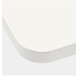
Optional table top with 40 mm corner radius